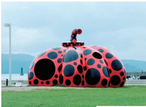
"Red Pumpkin" ©Yayoi Kusama, 2006 Naoshima Miyaura Port Square