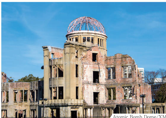
Atomic Bomb Dome/XM