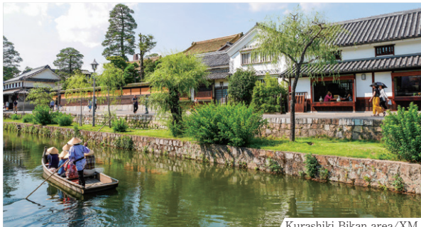
Kurashiki Bikan area/XM