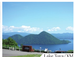
Lake Toya / XM