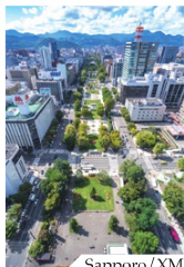
Sapporo / XM