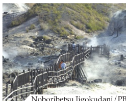
Noboribetsu Jigokudani / PB