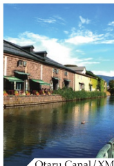
Otaru Canal / XM