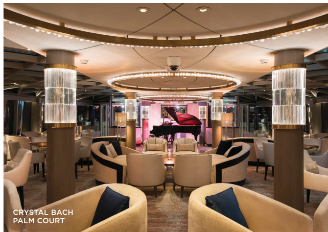
CRYSTAL BACH PALM COURT