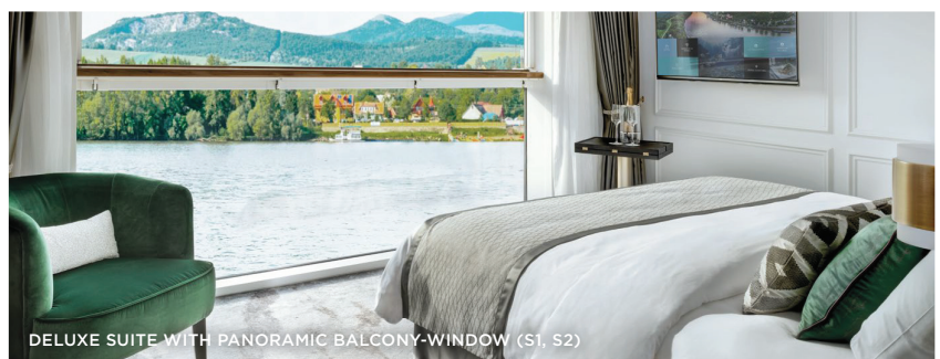
DELUXE SUITE WITH PANORAMIC BALCONY-WINDOW (S1, S2)