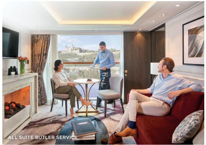
ALL SUITE BUTLER SERVICE