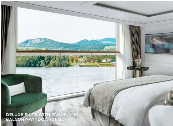
DELUXE SUITE WITH PANORAMIC BALCONY-WINDOW (S1, S2)