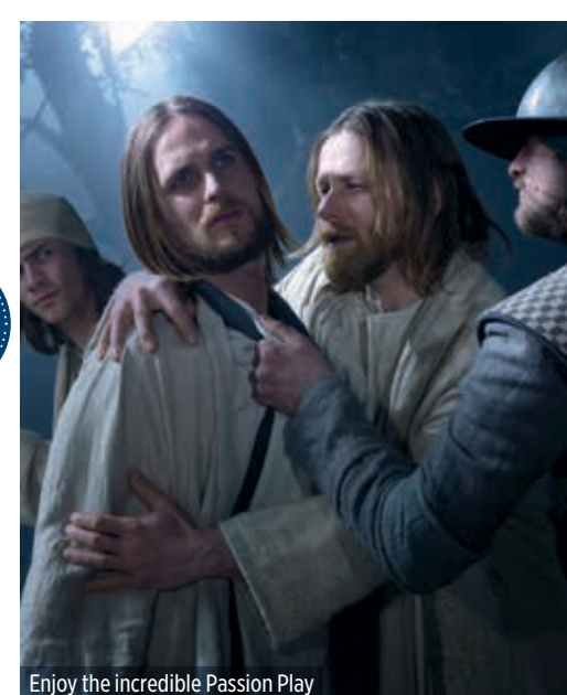
Oberammergau Passion Play 2020

This morning we drive to nearby Munich where your tour ends on arrival. Drop off points will be in the city centre and Munich airport. We recommend you book flights or trains that depart Munich after 2pm. Meals: B