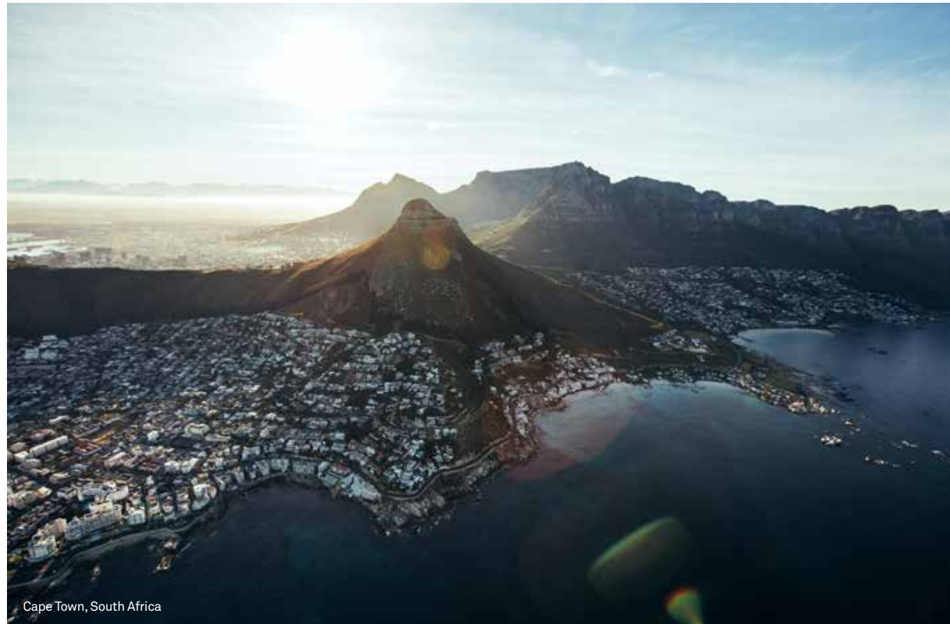
Cape Town, South Africa