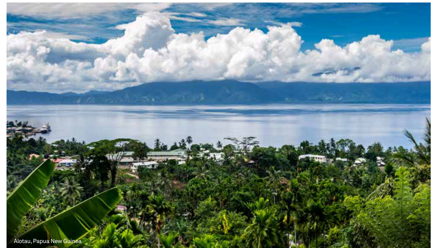
Alotau, Papua New Guinea

For more information and to view all fares, visit cunard.com/Q033A