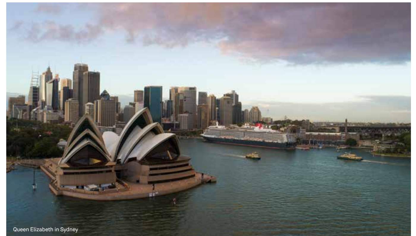
Queen Elizabeth in Sydney

For more information and to view all fares, visit cunard.com/Q102