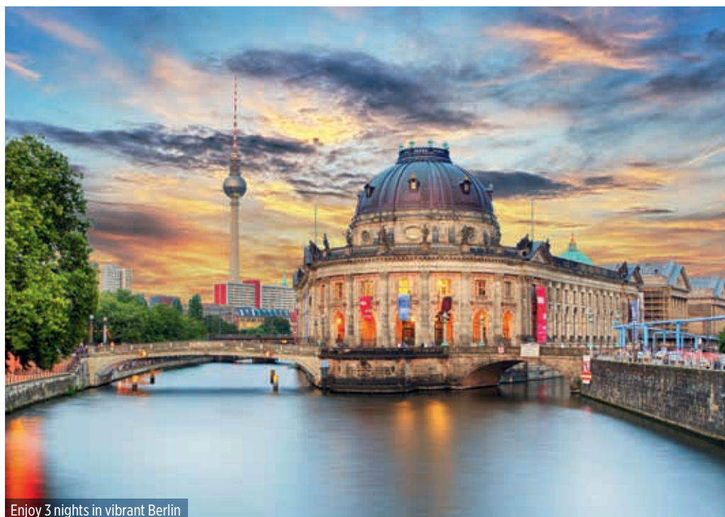
Enjoy 3 nights in vibrant Berlin

"Albatross truly stands out as exceptional in value, the choice of hotels, the informed local guides & the many extras that your company includes." Jenny