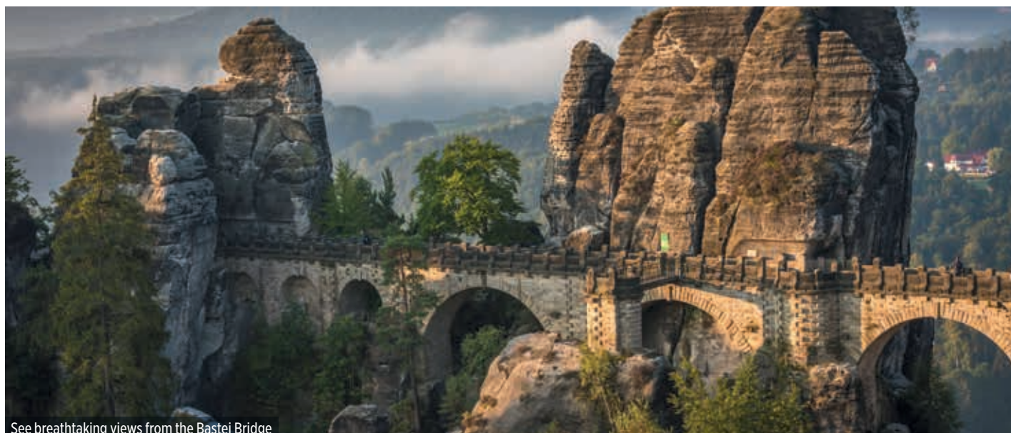
See breathtaking views from the Bastei Bridge

Often called the 'Prussian Versailles', Frederick the Great's iconic Sanssouci Palace is certainly magnificent. But there is so much more to Potsdam! Between 1730 and 1916, 500 acres of parks, lakes and gardens were lavishly developed along with 150 palaces and ornate buildings. There is even a giant windmill! UNESCO designated the entire area as World Heritage listed, and that is why we spend a whole day exploring it! Sanssouci Palace was Frederick's smaller and more intimate home, and naturally we visit his spectacular terraced gardens. We also visit inside the enormous 'New Palace', which was sumptuously built to impress the world! Incredibly, it is 16 times bigger than Sanssouci! We enjoy lunchtime in Potsdam's rejuvenated Dutch Quarter; we send you back in time as you stand on the infamous Bridge of Spies, and in the Kaiser's Cecilienhof Palace, beside the table where a Dictator, a President and a Prime Minister changed the world forever! What a day! See Day 4.