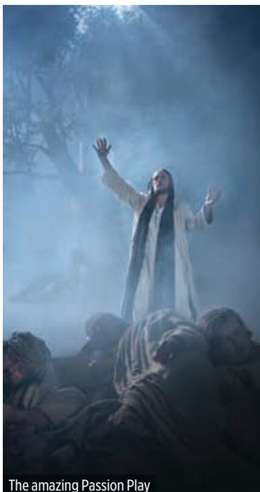
The amazing Passion Play Oberammergau Passion Play 2020

Many people do not realise that Germany and the Czech Republic boast some truly extraordinary scenery, much of it so easily accessible. Take Spreewald, for instance. By staying 2 nights here, right in the delightful inland harbour town of Lübbenau, we can enjoy an incredible day exploring the amazing labyrinth of pretty waterways. So beautiful, so rewarding, and the hardest thing you have to do is just sit and relax on a punt! Then, there are the two stunning National Parks of Saxon and Bohemian Switzerland. The Bastei Bridge and Königstein Castle are simply dramatic. And, for those that want a true adventure we take you deep into the Bohemian National Park, unless of course that day you choose to stay and relax and shop in glorious Dresden. The Bastei, Königstein, Saxon Switzerland, Bohemian Switzerland? Never heard of them? 'Google' images of them and you will be simply amazed how quickly they rise up your 'bucket list'. See Days 5, 6 and 8.