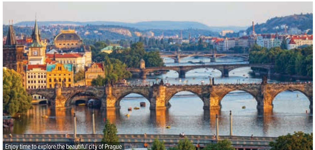
Enjoy time to explore the beautiful city of Prague